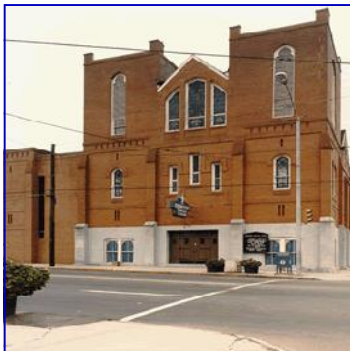
Ebenezer Baptist Church