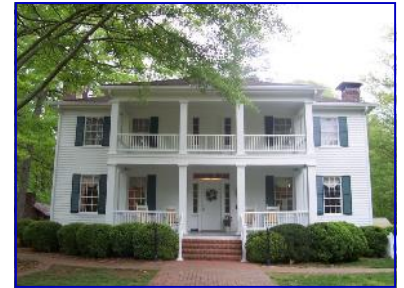
Stately Oaks Plantation - Gone with the Wind.